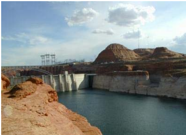
Height Modernization will allow more accurate monitoring of the effects of drought on reservoir levels and aquifers, measure results of tectonic activity across the state, and assess the safety of critical structures such as the Glen Canyon Dam pictured here.

In addition to important activities identified in the Forum, the Height Modernization Working Group members have identified actions and are pursuing Height Modernization and map modernization to benefit Arizona.